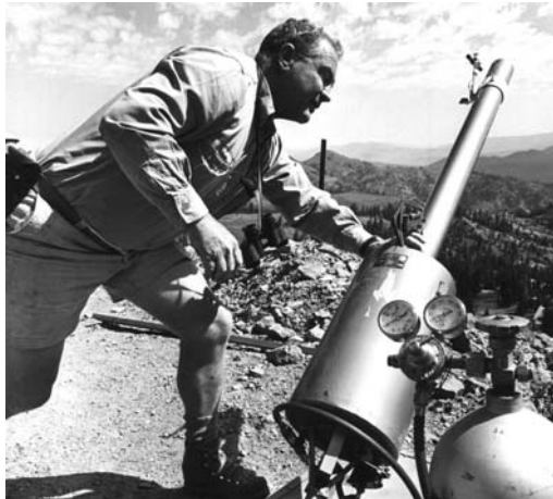
Figure 1. Monty Atwater demonstrating the original Mark 10 Avalauncher at Squaw Valley, California in 1962.

OK, I'll admit it: I've always been a big Monty Atwater fan. Not only is the man credited with being the father of modern avalanche forecasting and safety in the United States, but he is also responsible for developing the Avalauncher. Through its more than 40-year history, the Avalauncher has gone through many changes yet continues to prove its worth in avalanche