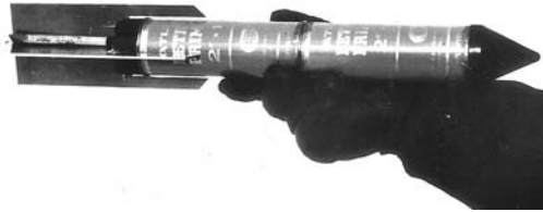
Figure 3. An early projectile system using Nitromon, safety fuse and a pull wire igniter.

wire igniter. The t-handle, which was just an old piece of out-dated fuse, was removed and the remaining wire passed through a hole in the projectile's base plate. The igniter wire was then tied off to a fixture on the gun. This way, when the gun was fired it would begin the ignition sequence.