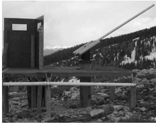
Figure 5. Falcon GT Avalauncher.

rotating the breech plug 45 degrees. Lastly, the launcher is supplied with the firing valves at the end of almost 6 meters of pneumatic line for remote firing behind blast shields.